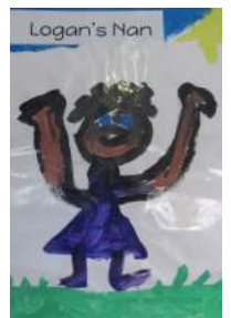
Our Nans - Prep