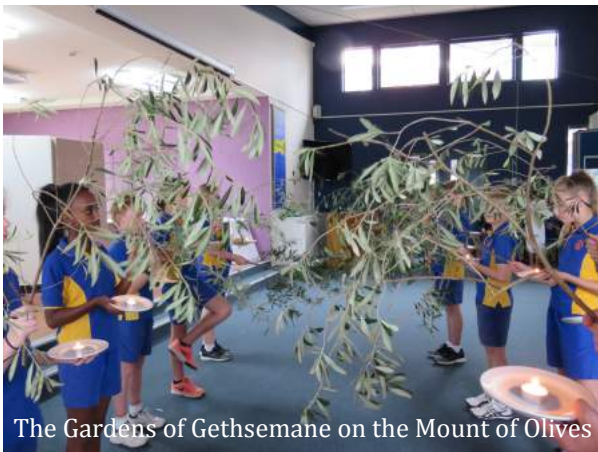
The Gardens of Gethsemane on the Mount of Olives