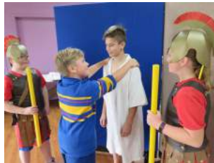
Betrayed by a friend and arrested by Roman Soldiers to be taken to court before Pilate.