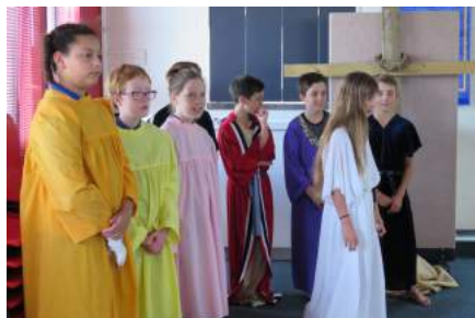
Early Sunday morning, Mary Magdalene and some other women went to the tomb but found it empty. Angels declared "Jesus has risen".