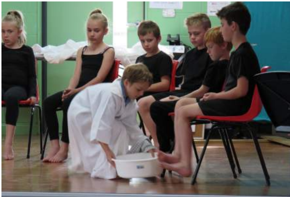
The washing of the Apostle's feet - Holy Thursday