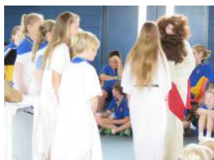
Jesus appeared to the Apostles and Mary. "Peace be with You. Go forth and tell others that Jesus loves everyone so much he died for them." Easter Sunday.