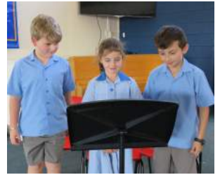
After the Last Supper, Jesus and the Apostles prayed for strength against temptation.