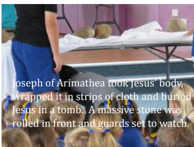
Joseph of Arimathea took Jesus' body, wrapped it in strips of cloth and buried Jesus in a tomb. A massive stone was rolled in front and guards set to watch.